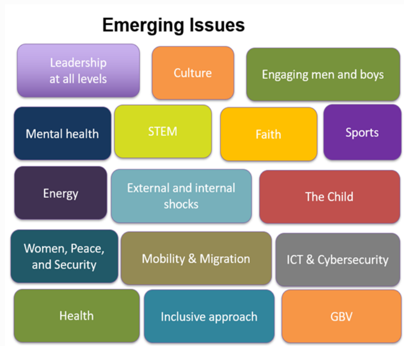
Diagram 3-Emerging Issues