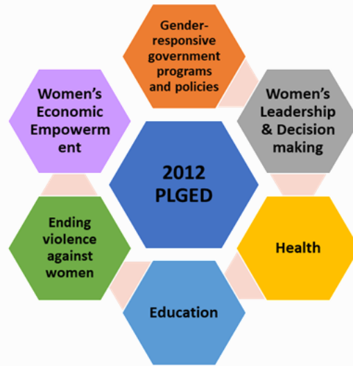
Diagram 2-2012 PLGED focus

4. The consultations confirmed the need to amalgamate the revitalised PLGED to the 2012 priorities, the Beijing Platform for Action (BPA) Critical Areas and the two Pacific specific areas of culture and disability as reflected in the PPA, as well as emerging issues from the consultations. It also confirmed the need to reflect these priorities within the seven thematic areas of the 2050 Strategy.