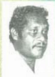
PAPUA NEW GUINEA Palas Wingti