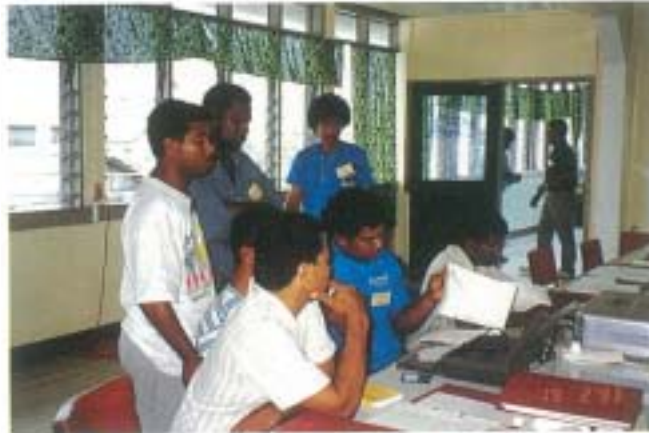
A training session on consumer energy metering improvement held in Apia, Western Samoa. The course was organised by the Forum Secretariat's Energy Division.

A total of 166 officers from 13 FICs have participated in this programme which is expected to cost F$471,000 in 1992/93.