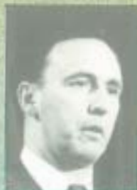
AUSTRALIA Paul Keating