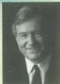
NEW ZEALAND Jim Bolger