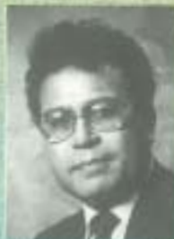
COOK ISLANDS Sir Geoffrey Henry