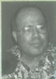
VANUATU Maxime Carlot Korman