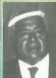
FEDERATED STATES OF MICRONESIA HE Bailey Olter