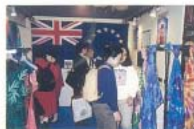
Regional co-operation at work. FICs display their wares at the Tokyo International Fair this year