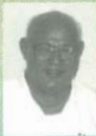
WESTERN SAMOA Tofilau Eti Alesana