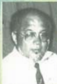
NAURU HE Bernard Dowiyogo