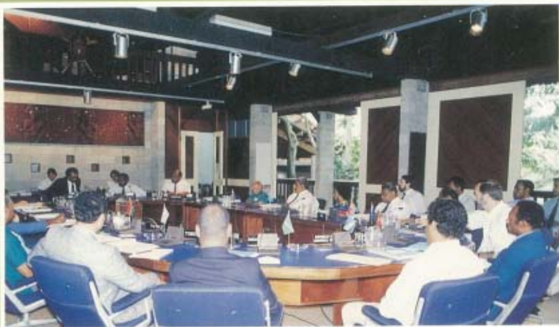
A meeting of Heads of Prisons of Forum Island Countries (FICs) in progress at the South Pacific Forum Secretariat headquarters — one of the many meetings serviced by the Secretariat