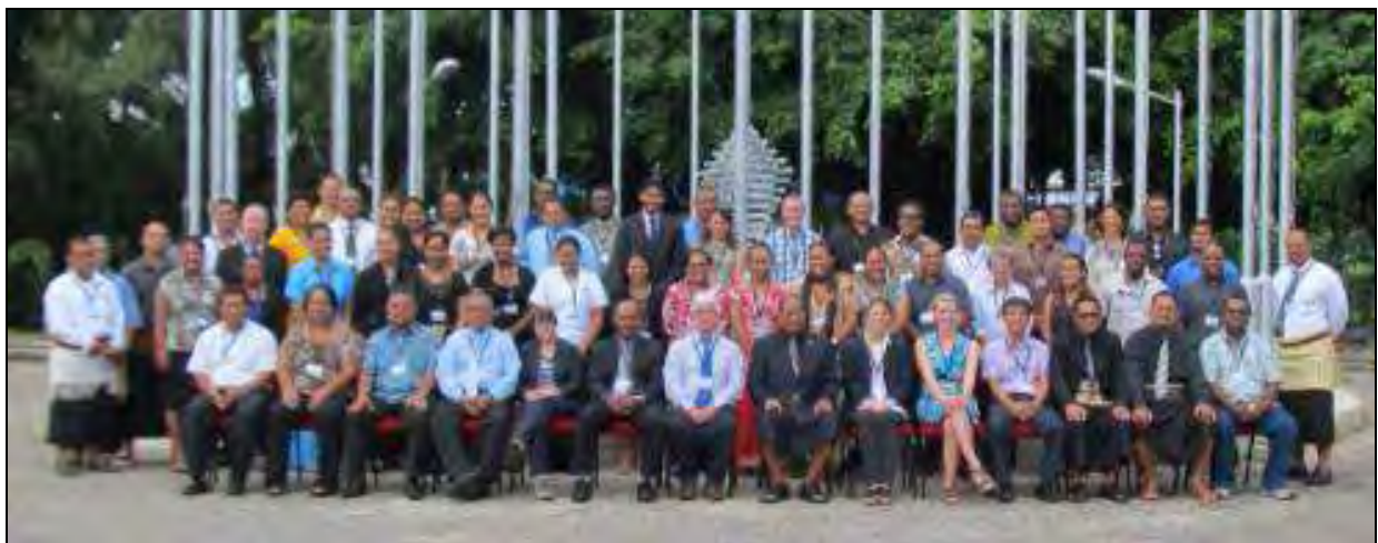
Figure 2: Participants of the 2 nd Regional Training Workshop in Nukua'lofa Tonga.

Recognising that many Pacific ACP States do not have the necessary capacity and negotiation skills to engage with extractive industries, the 2 nd regional DSM training workshop was held in Nukua'lofa Tonga in March 2013 (Figure 2). The workshop focused on the theme: "Deep Sea Minerals Law and Government-Company Commercial Agreement Negotiations", to enable participants better understand important legal and contract negotiation aspects of DSM activities. With a number of companies approaching Pacific ACP States for partnership and/or sponsorship, contract negotiation is considered a matter of priority.