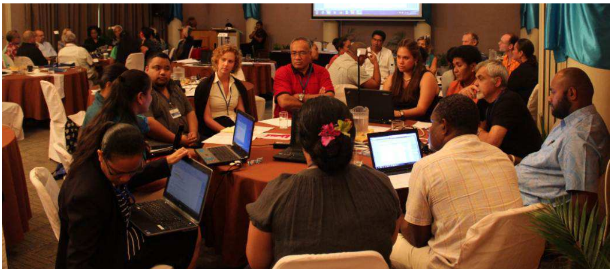
Figure 6: Participants during working group discussions.

Apart from SPC and SPREP presenters and facilitators, participants representing government agencies, the private sector, research institutions, and CSO also made presentations. Participants were encouraged to participate in panel, plenary and working group discussions.