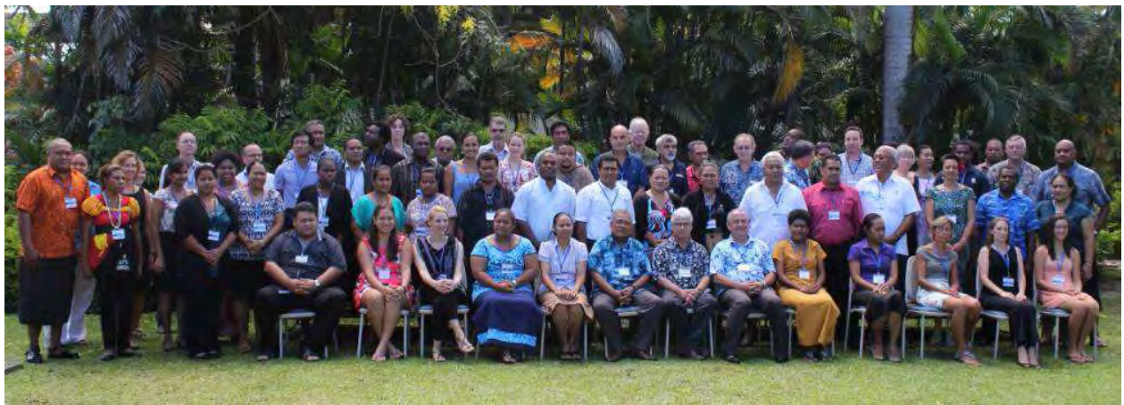
Participants of the 4 th Deep Sea Minerals Regional Training Workshop, Nadi Fiji, December 2013.