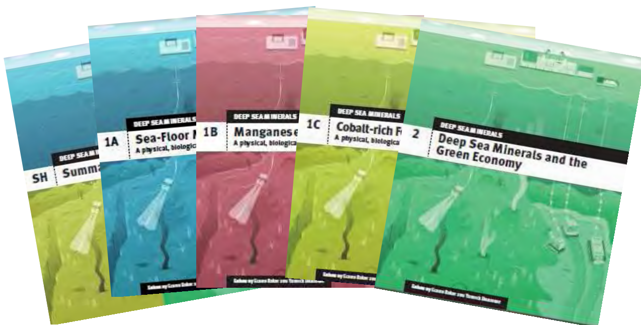
Figure 13: The Pacific Marine Minerals report comprising an Executive Summary, Volumes 1A, 1B and 1C, and Volume 2.

UNEP/GRID-Arendal was contracted by the Project in June 2011 to compile a report on the state of knowledge of Pacific marine minerals (Figure 13). There were delays in finalising this report, largely due to chapter authors and reviewers (working on voluntary basis) having some difficulties in finding the time to complete their chapters. Additionally, a significant amount of time was required by certain authors and reviewers to ensure the content is up-to-date and of the highest quality.