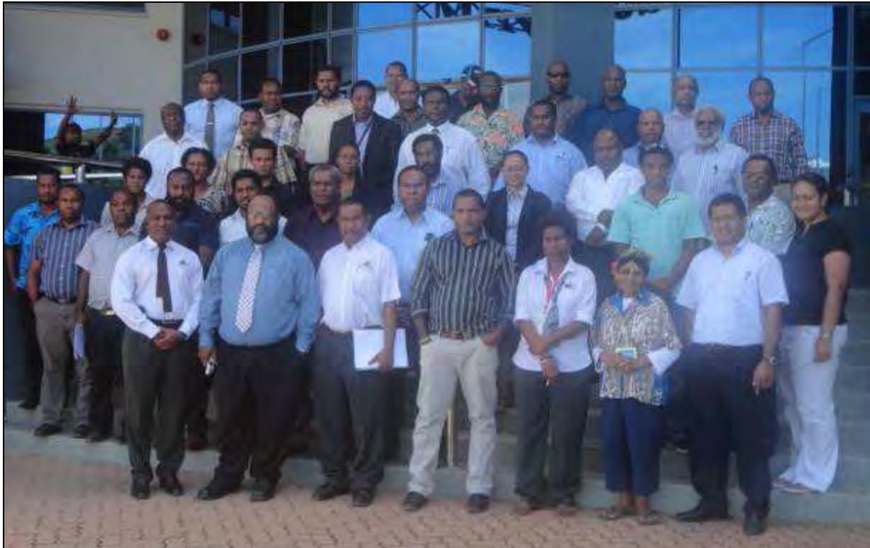
Figure 1: Participants of the PNG National DSM Stakeholder Consultation Workshop.

Nine major action points were identified during the workshop that requires the Project's assistance: