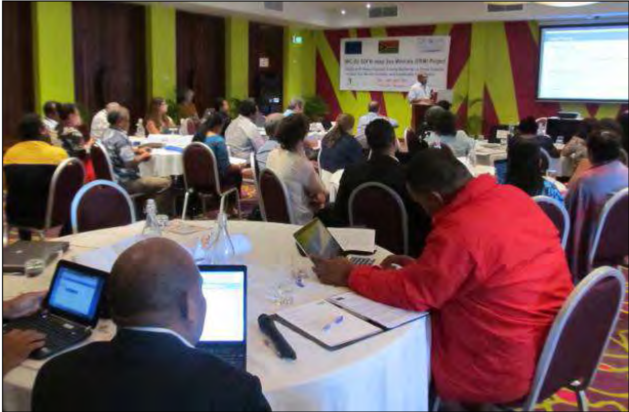
Figure 3: Participants of the 3 rd Regional DSM Training Workshop in Session.

In his opening address, the Honourable Minister for Lands and Natural Resources, Mr Ralph Regenvanu, said that wider stakeholder consultation is needed before any further action is taken with regards DSM activities in Vanuatu. The Minister's comments resonated well with the workshop's objective to promote and encourage greater stakeholder consultation on DSM issues in the Pacific ACP States.