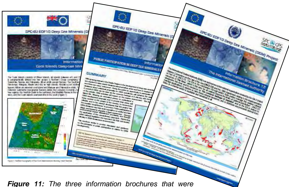
Figure 11: The three information brochures that were prepared and published in 2013.

The International Seabed Authority (ISA) information brochure describes how the organisation was established, its structure and functions. It explains the opportunities for Pacific Island Countries as members of the ISA, how they can engage, and the duties of sponsoring States in 'the Area'.